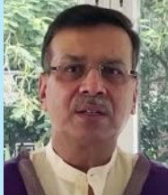
Dr Sanjiv Goenka