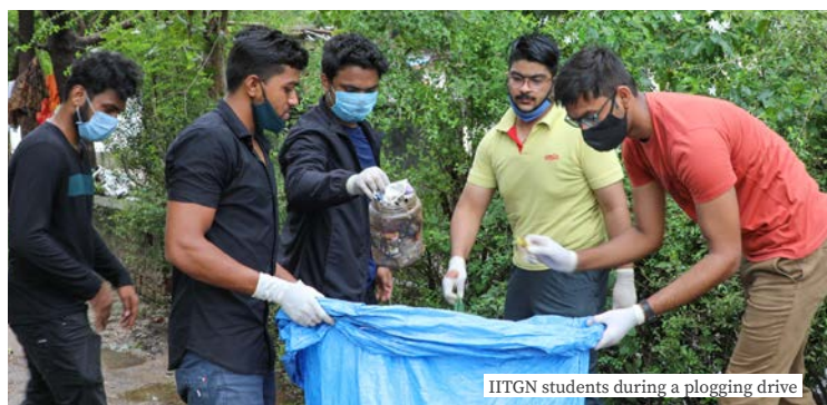
IITGN students during a plogging drive