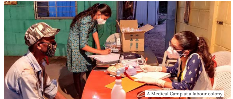
A Medical Camp at a labour colony

cooperation, and research collaboration among faculty members of both the institutes. Selected meritorious students of both the NITs can now be a part of the IITGN-SRIP, study a semester at IITGN, and apply for the Start Early PhD Programme at IITGN. Academic and research collaboration between faculty members will also be facilitated.