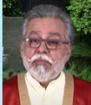
Dr Pawan Munjal

IITGN hosted the landmark 10th Convocation on Aug 29, 2021, through a heartwarming virtual ceremony. The Institute conferred degrees to a total of 548 students, including 175 BTech students, 5 Dual Major BTech students, 1 BTech-MTech Dual Degree student, 155 MTech students, 95 MSc students, 30 MA students, 86 PhD students, and 1 PGDIIT student. Total 52 students received 58 medals, including 42 gold medals and 16 silver medals for excellence in various categories. This year, IITGN graduated the first batch of its five-year Dual Major BTech programme. Dr Pawan Munjal , Chairman & CEO of Hero MotoCorp Ltd, was the Chief Guest on the occasion. In his motivating Convocation address, Dr Munjal encouraged the graduating students to dream big and lead the India of the future. Dr Sanjiv Goenka , Chairman