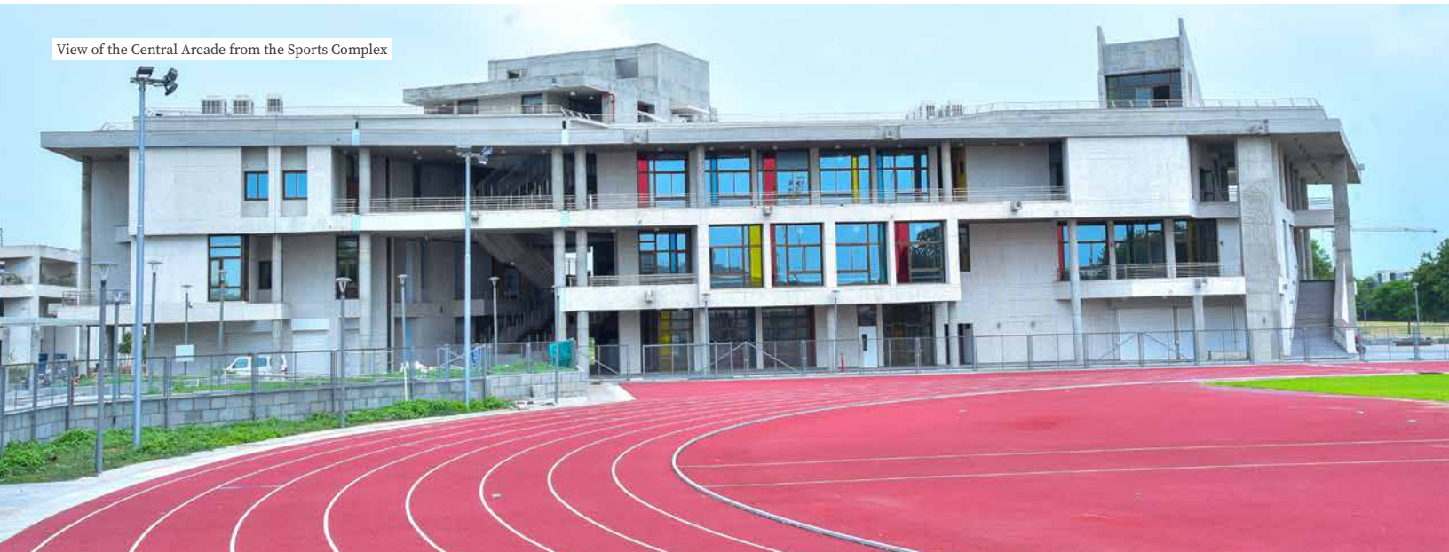
View of the Central Arcade from the Sports Complex

The PE section resumed cricket and football sessions for the students in offline mode with all the COVID-related safety precautions. The cricket sessions were conducted by Mr Ratnesh Singh , and the football sessions were guided by Mr Dinesh Parmar .