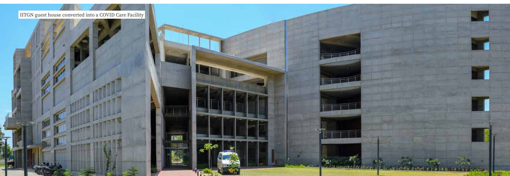
IITGN guest house converted into a COVID Care Facility