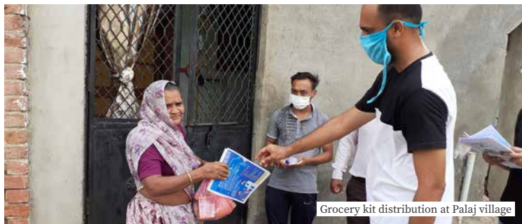
Grocery kit distribution at Palaj village

Campus development continued to make significant progress, and the Guest House, Central Arcade, Open Air Theatre, 1 BHK, 2 BHK, some studio apartments, and some new hostel blocks were occupied by IITGN. The Bank and the Medical Centre have already started operating from their new location in the Central Arcade. Construction of remaining hostel and housing blocks, Research Park and Sports Complex are also nearing completion.